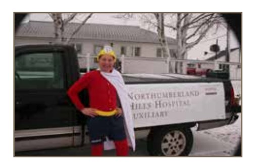
Save the date! Polar Dip! February 16th